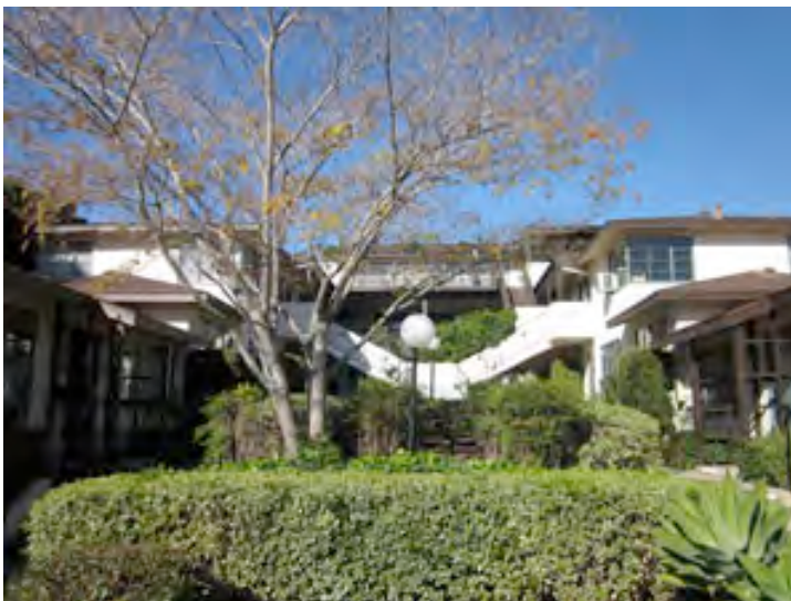
The new office!